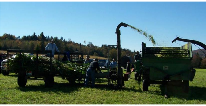
Corn Harvest Day 2013