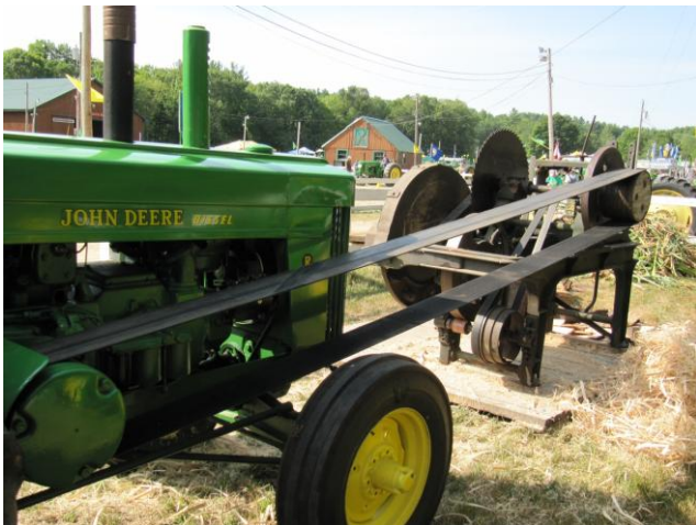
2010 Expo IV