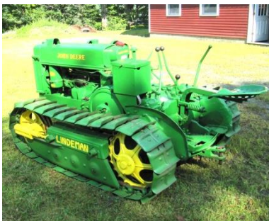
1946 Electric Start, 12” Tracks

A variety of attachments were available including factory and after-mount dozer blades (often Holt), plows (up to 3 bottom based on gearing and traction). Consistent with all Waterloo models, it had the built in flat belt drive capability as inherent to the hand clutch system.