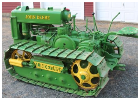
1947 Flywheel Start, 14” Tracks