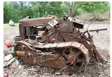
Year? Electric Start – Was for Sale online? Probably High Restoration Skills Needed

http://www.mytractorforum.com/showthread.php?t=58110