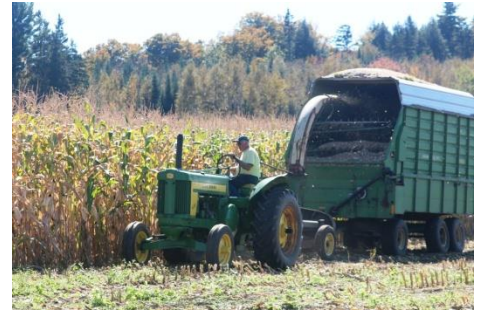
Corn Harvest Day 2013: Photos by J Schonberg