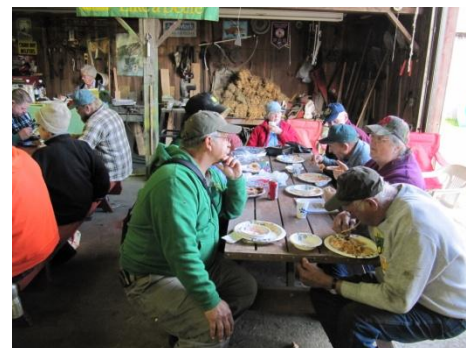
Foliage Tractor Ride